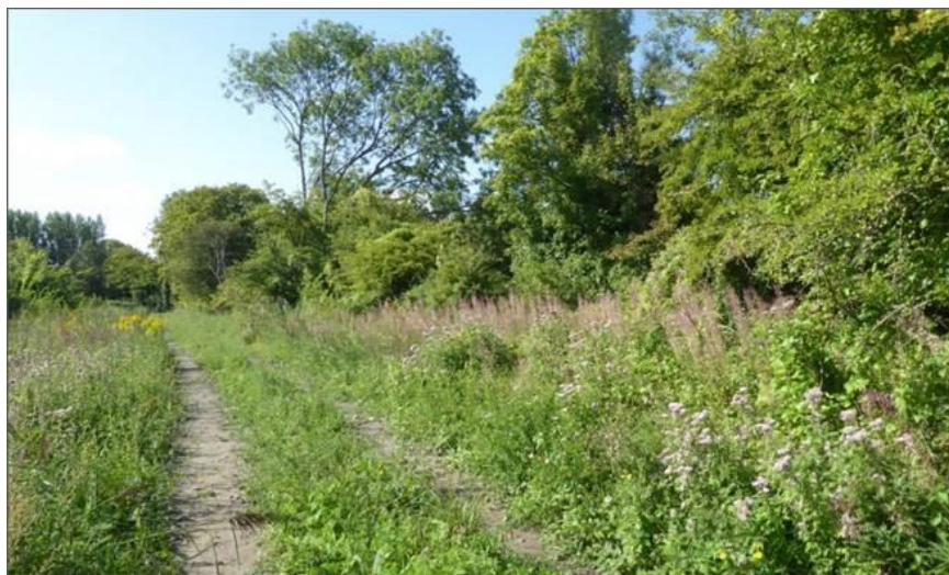
Plate 2: Typical View of the Trackway