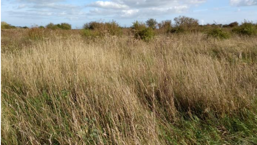
Plate 1: Typical View within the Grassland Survey Area